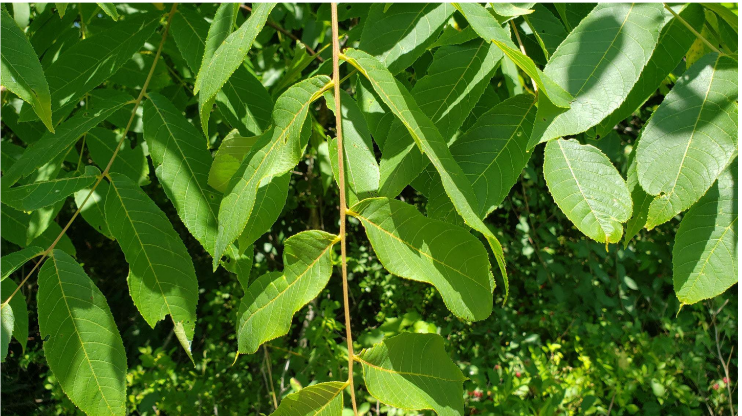
Black walnut foliage at Coe Hill

Tree species observed in the upper canopy sawtimber sizes (12" diameter and up), included black walnut, hickory, northern red oak, black oak, scarlet oak, white oak, sugar maple, red maple, black cherry and black birch. Most of these trees occupied space with low stocking or density. There was no real midstory of medium-sized or pole-sized trees (6-10"), and there was some regeneration in the seedling-sapling size class, but they were often being overwhelmed by invasives or were expected to be. Forest regeneration frequently included the same species of oaks, hickories, maples, as well as black birch and black cherry. Black walnut was prominent as seedlings and saplings.